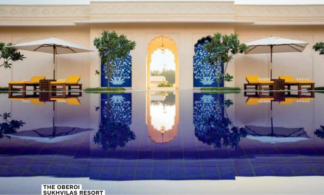
THE OBEROI SUKHVILAS RESORT & SPA

Le Corbusier's mysterious metropolis now boasts luxury accommodations to match its modernist pedigree