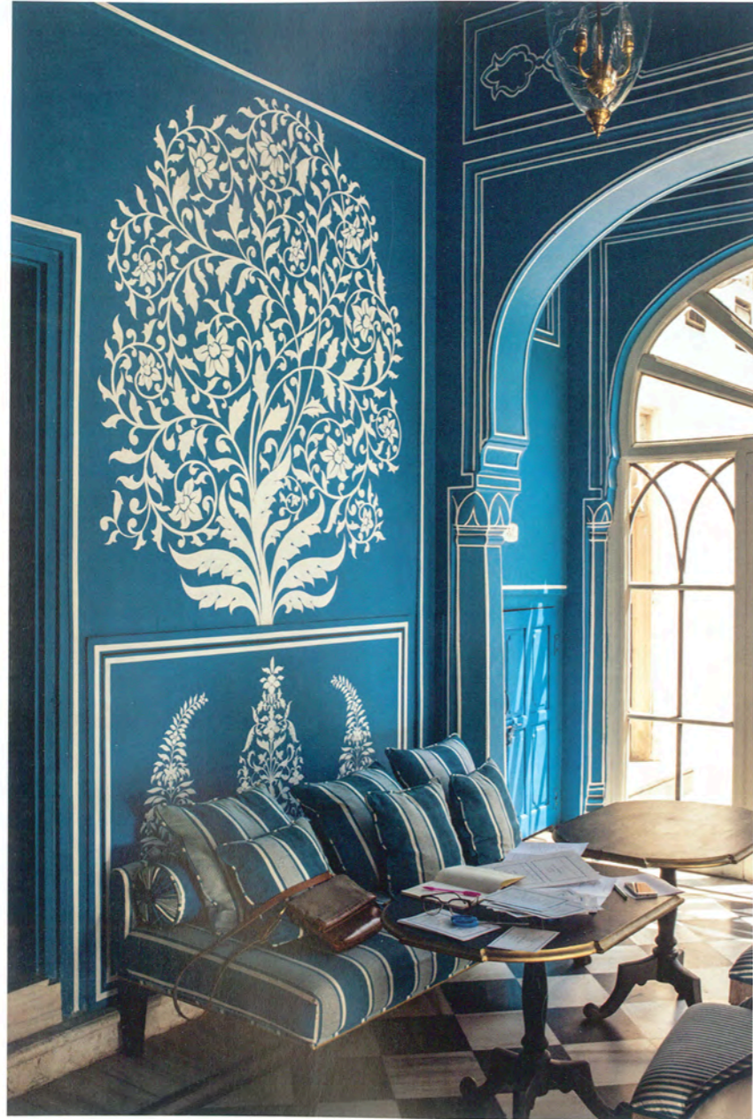
left and opposite Floral decoration of traditional Rajput and Mughal type but in two colours only, in the Bar Palladio in Jaipur.