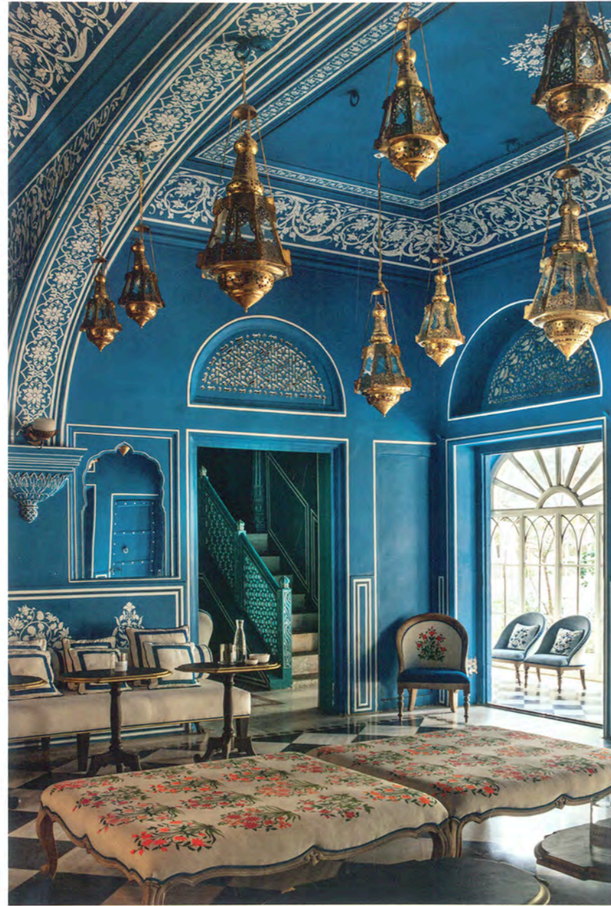
left and opposite In the Bar Palladio in Jaipur a flowering creeper rolls and curls along the concave coving of the ceiling of the bar area. (For the ornament on the seats in the foreground, by Gito Patni, see pp. 178–79.)