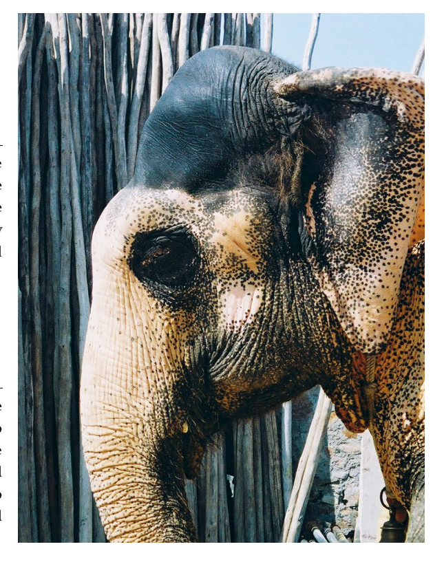
RIDE AN ELEPHANT UP TO THE AMBER FORT